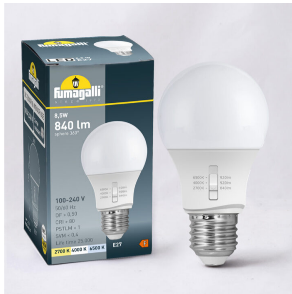
E27 A60 8,5W