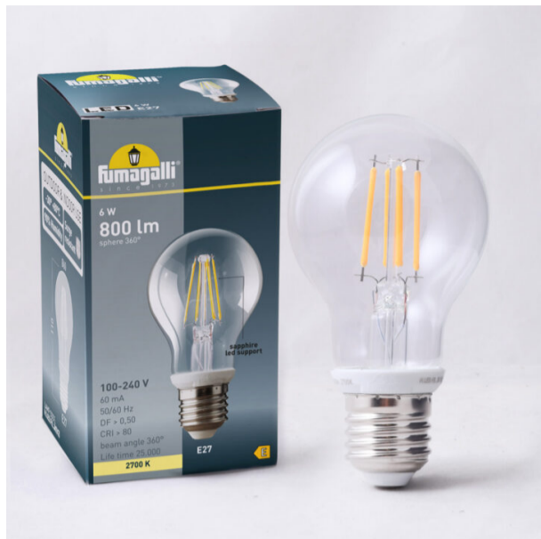
E27 LED FILAMENT A60 6W